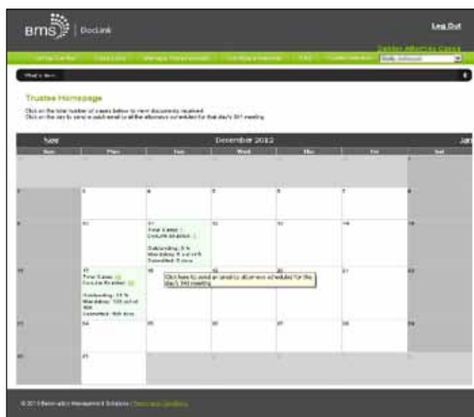
341(a) Meetings are presented in an easy-to-understand Calendar view listing total cases as well as DocLink-enabled cases for quick review